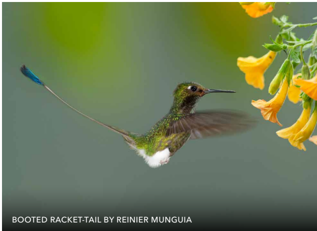
BOOTED RACKET-TAIL BY REINIER MUNGUIA