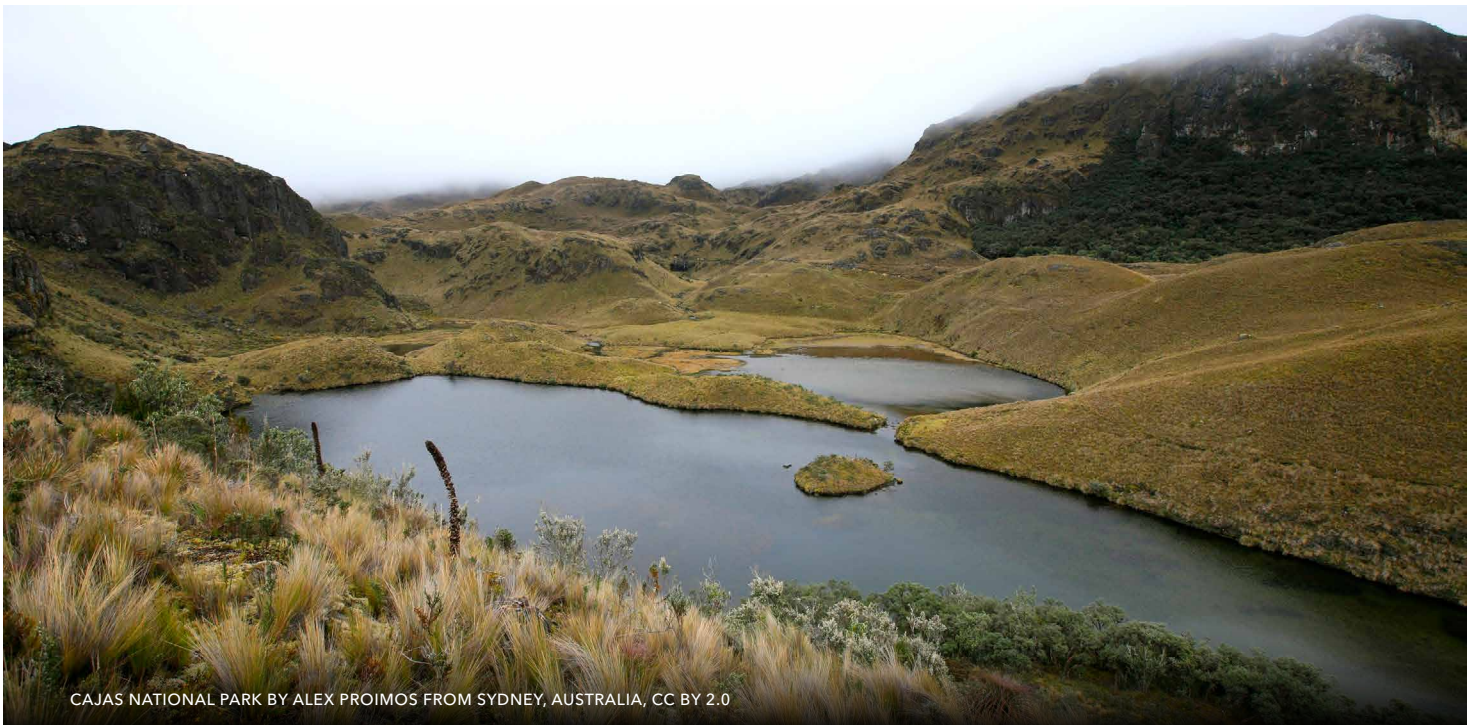
CAJAS NATIONAL PARK