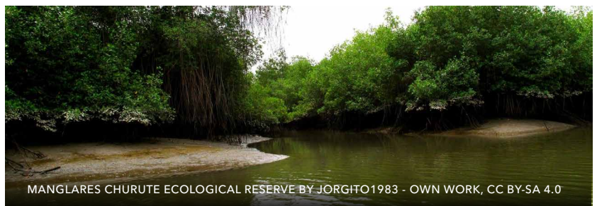
MANGLARES CHURUTE ECOLOGICAL RESERVE