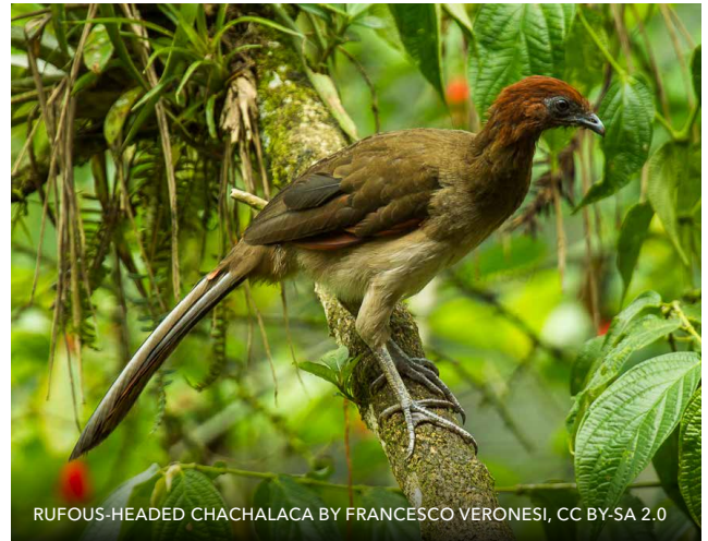
RUFIOUS-HEADED CHACHALACA BY FRANCESCO VERONESI, CC BY-SA 2.0