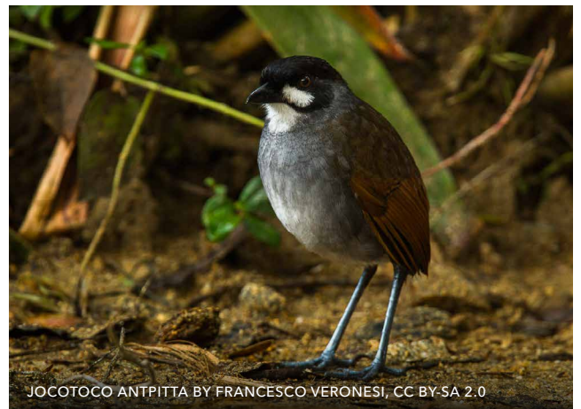
JOCOTOCO ANTPITTA BY FRANCESCO VERONESI, CC BY-SA 2.0

Rise early this morning for the two-hour drive in 4x4 pickups to Cerro de Arcos in the high páramo, where there are good chances to spot the Blue-throated Hillstar, discovered in 2017. Learn about the Jocotoco Foundation and its efforts to protect this high-elevation, critically endangered hummingbird. Lunch in the field. In the afternoon, continue birding at Buenaventura. The private, 4,150-acre reserve spans an elevation of 1,800 to 3,600 feet above sea level. It contains two important ecosystems, lowland tropical rainforest and foothill forest. This reserve is considered the southernmost region of the Chocó center of endemism, and has an influence of the dry Tumbesian center as well. Birds commonly seen in this area are Black-cheeked Woodpecker, Bran-colored Flycatcher, Ochraceous Attila, Cinnamon